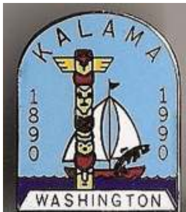
G1_Kalama_i (city pin)