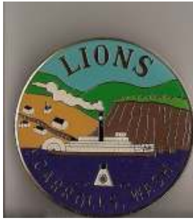
G1_Carrolls_b_posts at N & S