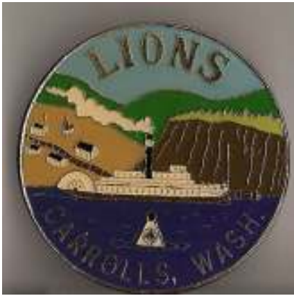
G1_Carrolls_a_posts at E & W