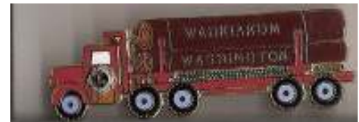
G1_Wahkiakum_c_blue wheels, ...